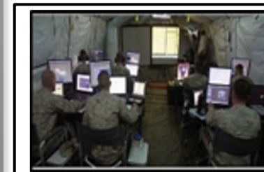
Operational Facility (OPFAC)