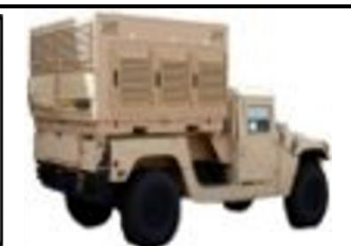
Aviation Command & Control System (AC2S)